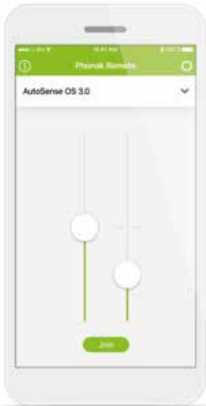
Volume adjustment for each side

For videos on how to use and setup the Phonak Remote app on your phone, please visit www.phonakpro.com/remoteapp