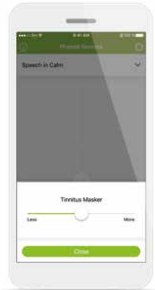
Tinnitus Noiser intensity