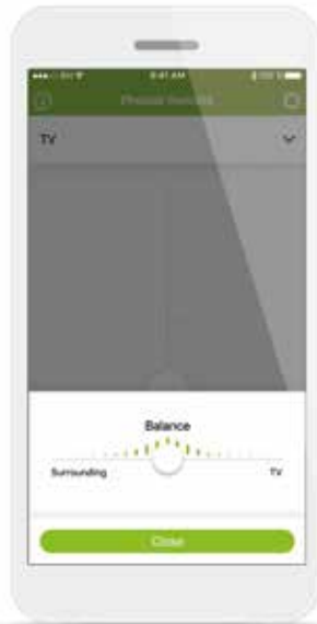
Environmental balancing of an audio stream