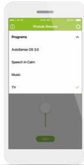
Program selection and customization