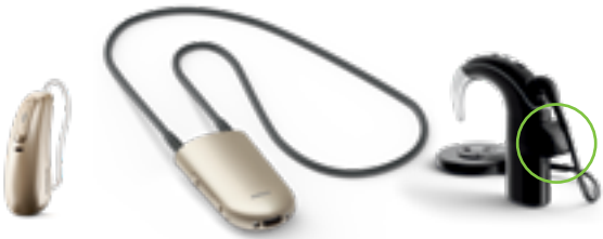
Hearing aid with RogerDirect

In hearing aids featuring RogerDirect™ the receiver can be installed directly. No need to add an external receiver. For other hearing aids and implants there are several types of receivers available.