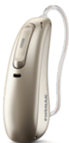
Phonak CROS P-13