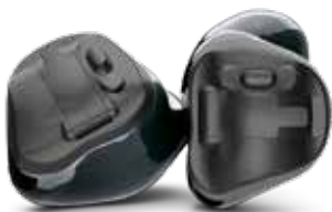
Virto P-312 embodies a smooth, modern, black design and resembles ear buds