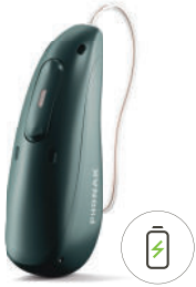
Phonak Audéo Sphere™