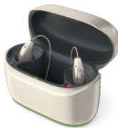
Phonak ChargerGo RIC I