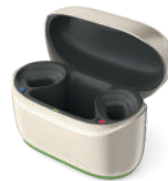
Phonak ChargerGo RIC Sphere I