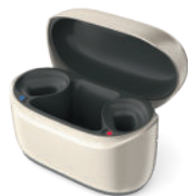
Phonak Charger RIC I