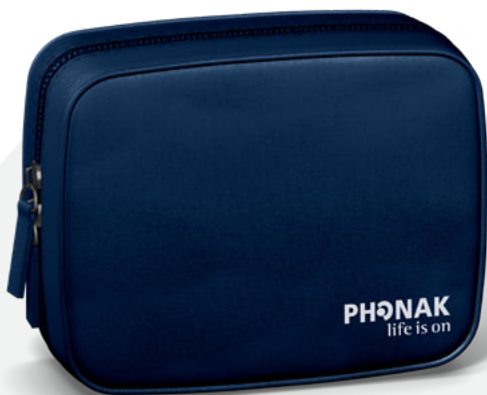
Phonak hygienic bag

All these additional items can be purchased separately.