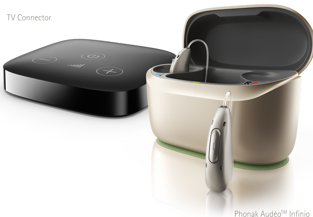
Phonak Audéo™ Infinio